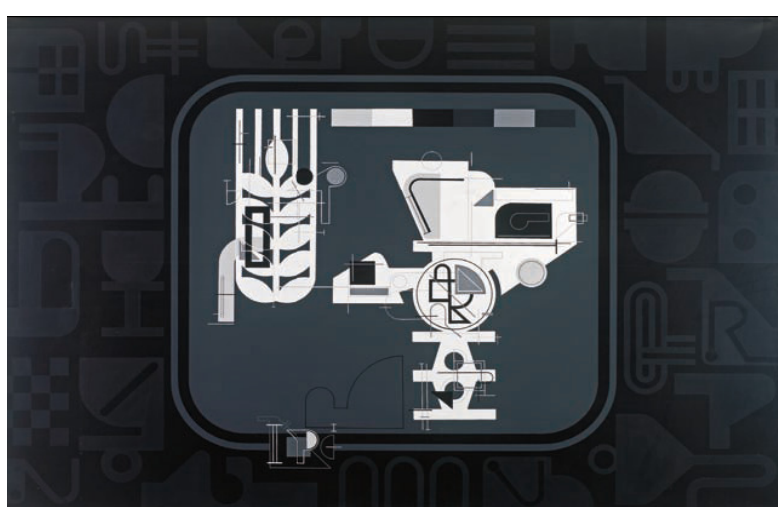
Still life with bust of harvest and ear; acrylic/ canvas, 170x250 cm, 2007

Guided tours at the Strabag House Vienna (Artlounge, Gironcoli- Skulpture Hall, Artcollection, Artstudio) are possible by appointment.