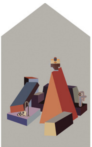
3 signs in the mountains, acrylic/canvas, 270x180 cm, 2008